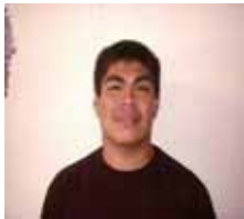
Arnold Tobon Restaurant