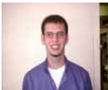
Nathaniel Ganas Restaurant