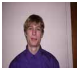
Keyes Ambrose Restaurant