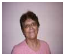
Ella Cromwell Restaurant